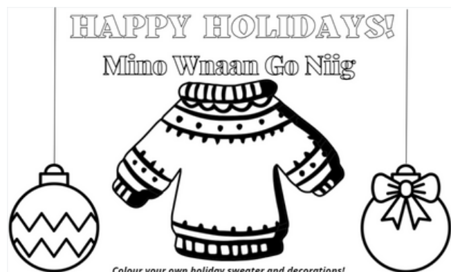
Colour your own holiday sweater and decorations!

Click the picture or here to find a full-size version of the colouring page. You can also request one from your Worker. Each month the submissions go into a draw.