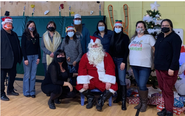
Nijaansinaanik Staff at the AC Homes Christmas Party taken prior to new gathering regulations